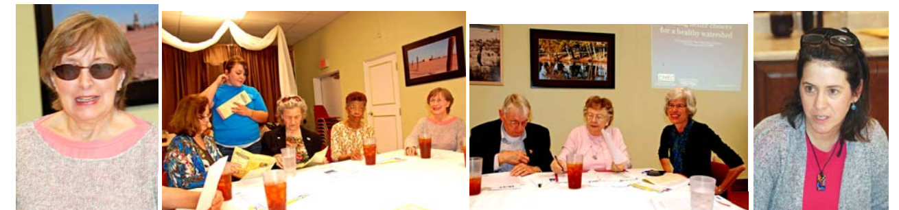
Participants at the Peace River Watershed Program