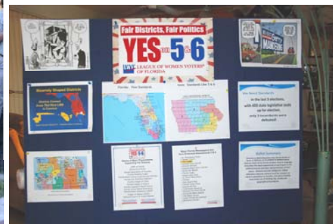
'YES on 5 & 6' Display

On October 7, the LWF of Polk County hosted a table at Lakeland's Politics in the Park.