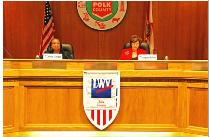
School Board Candidates