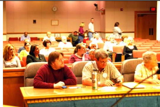
Audience entering behind timekeepers