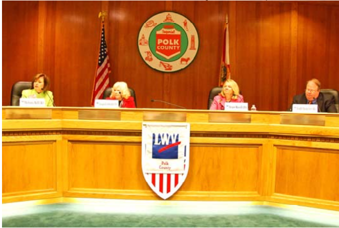
County Commission Candidates