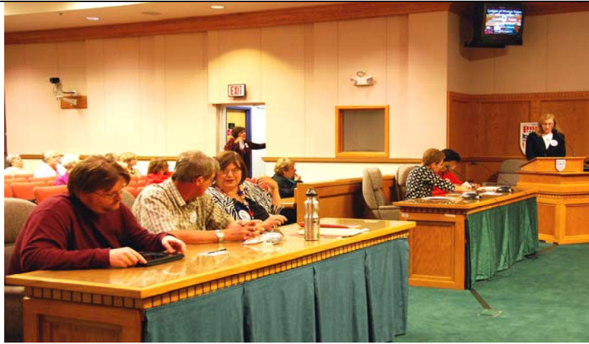
Timekeepers, questioners & moderator ready to begin (Note PGTV top right)