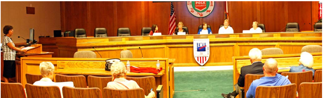
Ballot Amendments Panel