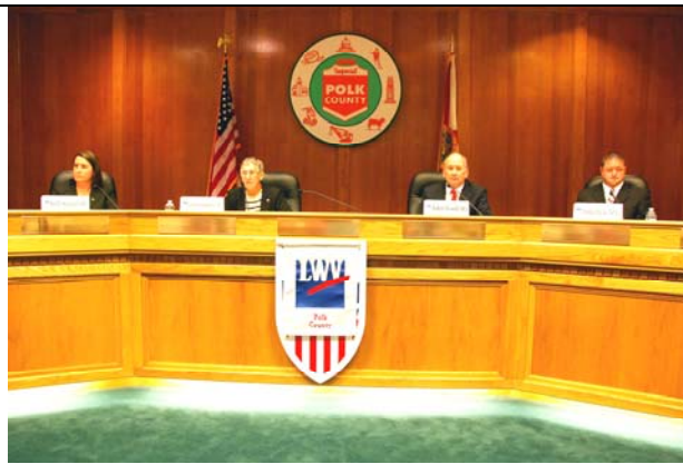
Florida Legislative Candidates