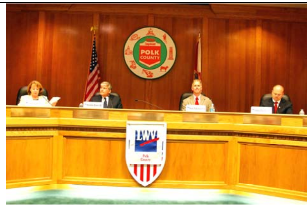
US Congressional Candidates