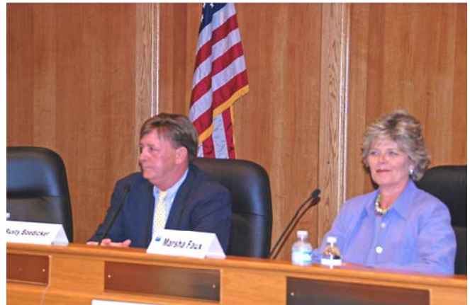
Candidate Panelists (above & below)