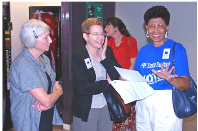
Waiting in the Lobby