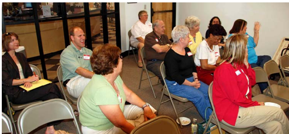
The Happy Audience