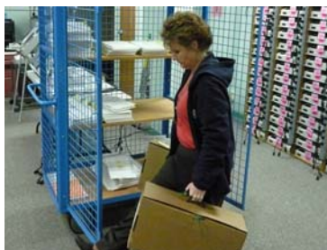
Removing the secured ballots