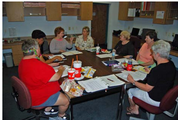
Board Meeting over Lunch